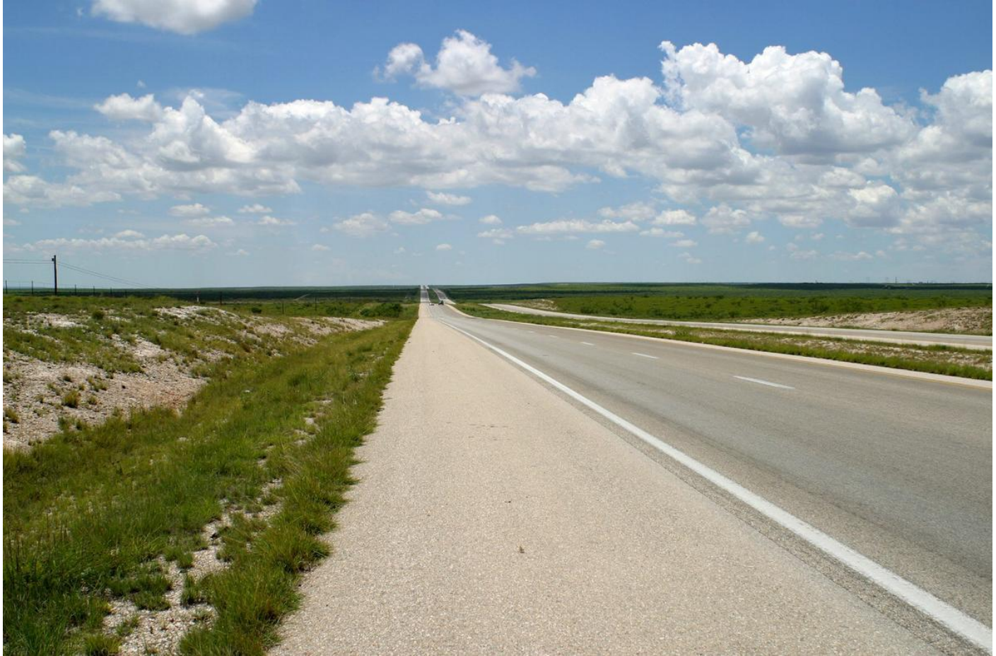
Route 62, east of Hobbs, New Mexico, the heart of America's "nuclear corridor."